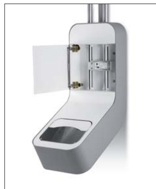
Receiving Tray with a brake