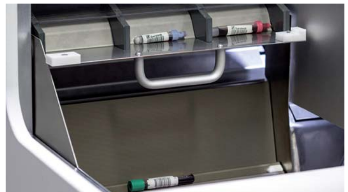
B: Urgent module