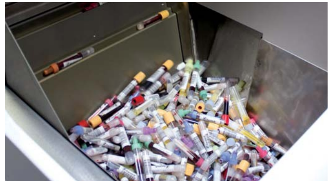
A: Sorting module

Necto comes standard with one sending module. One, two or three extra sending modules can be purchased.