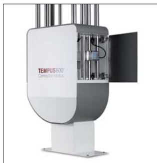
Connection Module with a brake