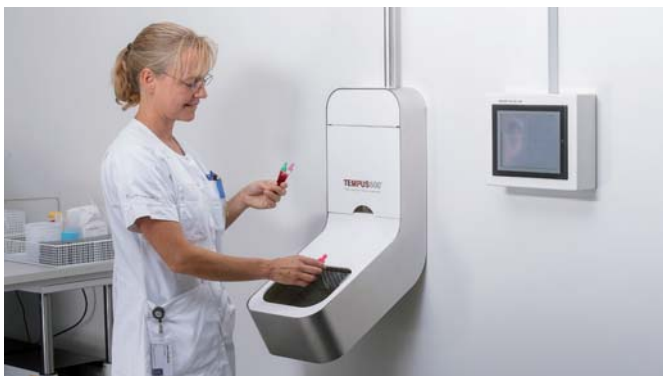
Samples arrive in the Receiving Tray where they are retrieved.