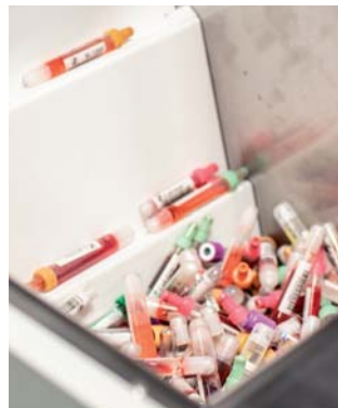
Loading in bulk