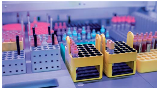
Automatic Output in Racks