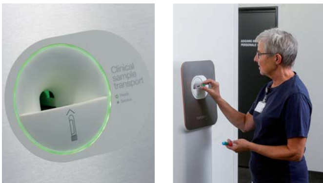
Sample tubes are placed in the insertion point of the Vita.

The slim and minimalistic design ensures the sending station fits into most locations, occupying very little space.