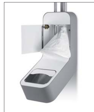
Filter bag for cleaning