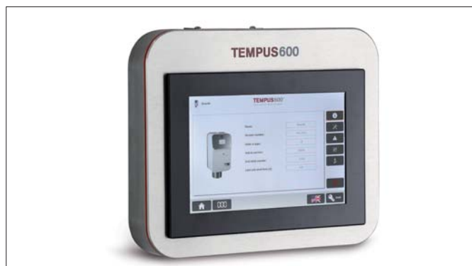
Intuitive user interface