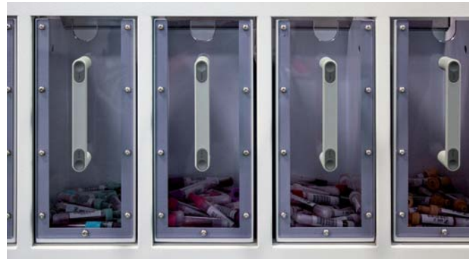
Sorting into target boxes

Tempus600® combined with Bulk to Bulk Sorter HCTS2000 MK 2, clearly simplifies the workflow in the sample reception area. The sorter registers and sorts closed sample tubes from the bulk into different target compartments according to the bar code (sample preparation) or test request specified by the LIS. With an optional camera in use, the system can perform a plausibility check and so identify and separate error samples. HCTS2000 MK 2 helps to optimize the workflow at sample entry of biochemistry or hematology labs and so reduces the turn-around-time (TAT) of samples.